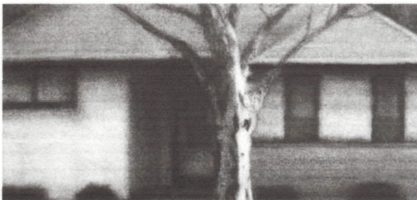
House #20 © Elaine Green

As the first place winner of CCC's international juried exhibition "Au Naturel: The Nude in the 21st Century", Green was offered a solo exhibition. She will bring to the Art Center Gallery Palimpsests : a collection of charcoal drawings, ceramic sculpture and print work. Green is recognized for her large and expressive drawings; primarily her subject matter has been the human form. This exhibition will also include a more recent series that explores and connects the relationship between our physical selves and our dwellings; specifically home. Green states, "Both are highly individualized, extremely personal, and seemingly exposed in the presentation of their public faces. Ultimately both houses and bodies are private spaces, semi-permeable containers that protect us, hide us, and sometimes give us away."